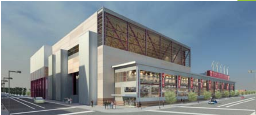
Temple University ▪ designed to LEED® Certified standards