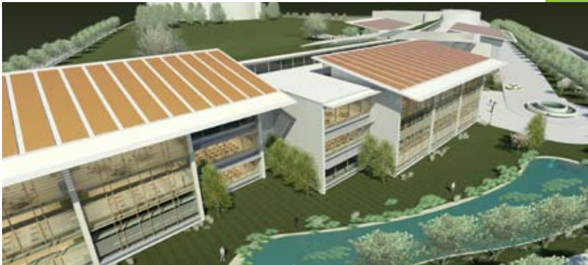
Int'l School of Luxembourg ▪ Sustainable Design Competition