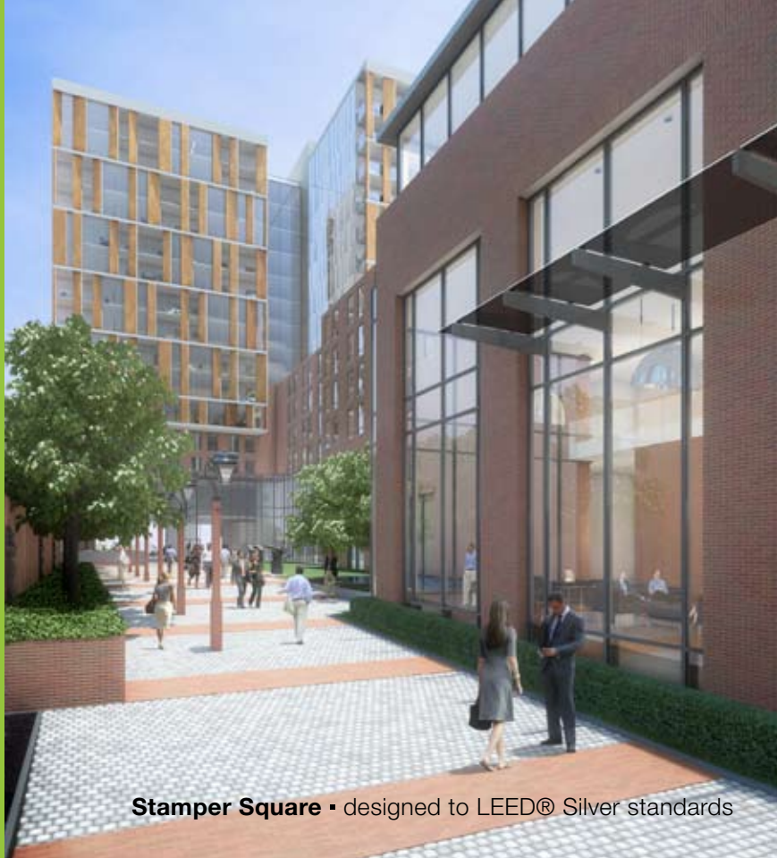
Stamper Square • designed to LEED® Silver standards

At H2L2, our expertise allows us to mentor clients, fostering an understanding of what sustainable concepts truly mean in terms of end results and returns on investment. We believe in creating socially vibrant, ecologically restorative, and economically sound communities. Our portfolio is a one-of-a-kind collection of beautifully designed spaces for work, life and recreation that truly enhance the well being of people and ecosystems for both now and the future. We have developed a seasoned staff of LEED® accredited professionals to engage in an industry-wide commitment to sustainability that will change the way the built environment interfaces with the world around us.